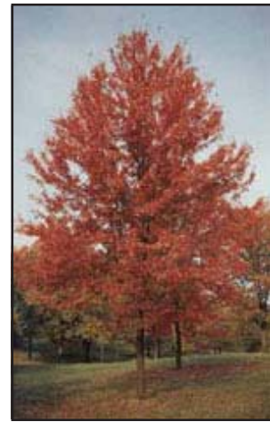
Autumn Blaze Maple

These trees are recommended. Not intended as a comprehensive list.